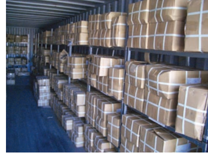
Heavy Duty Applications