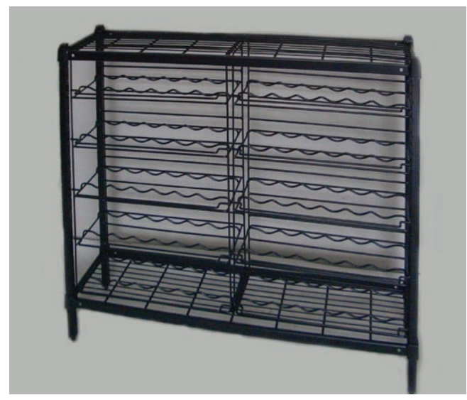
Bulk Wine Racks with Shelf Frame